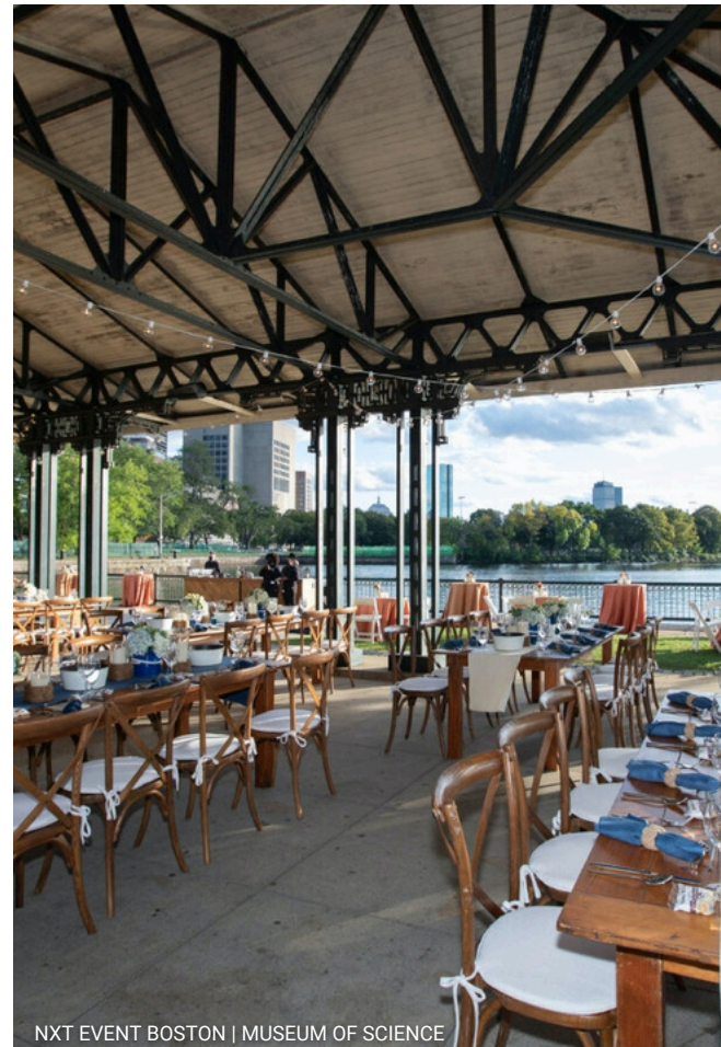
NXT EVENT BOSTON | MUSEUM OF SCIENCE

These events draw overlapping audiences, compressed timelines, and heightened expectations, making early coordination essential for brands, venues and partners planning experiences tied to these moments.