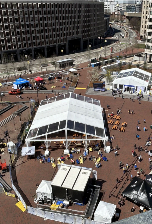
CORINTHIAN EVENTS | ABOVE SUMMIT

Boston's major citywide moments create an exciting opportunity for brands, venues, and agencies to engage audiences at scale. With multiple high-profile events happening across the city, early planning helps teams secure preferred dates, venues, and layouts while maintaining flexibility and creative control.